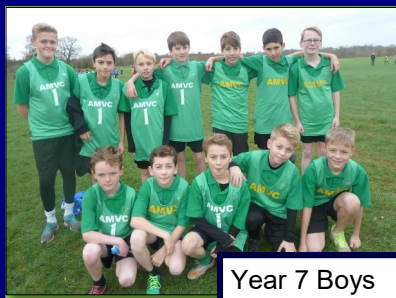
Year 7 Boys