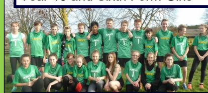
Year 8 and 9 (Boys and Girls)