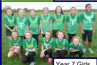
Year 7 Girls

Following on from our success in the first 2 Fenland League Cross-Country races, on Friday, 4 December 2015 we took students to the Peterborough Inter-Schools Cross-Country Competition at Ferry Meadows; we are pleased to announce that our students were outstanding. We won 3 of the 8 team categories, and came 2nd in another 3.