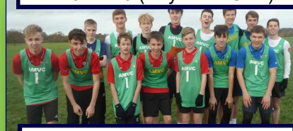
Year 10 and Sixth Form Boys