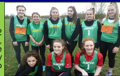
Year 10 and Sixth Form Girls