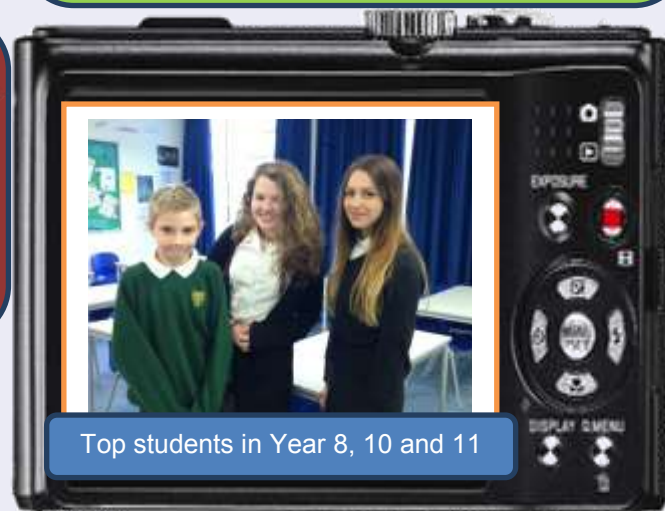
Top students in Year 8, 10 and 11