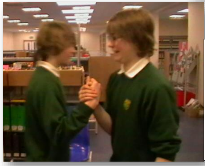
A very casual hand-shake style greeting between friends. Boys usually do this in Britain.